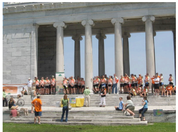
A salute to the tree fund raising riders at Roger Williams Park Providence, Rhode Island

Since its inception in 1992, the Tour has generated more than $4.5 million and has funded a host of diverse projects. More information on the STIHL Tour des Trees and opportunities for supporting the Tour can be found at www.stihltourdestrees.org .